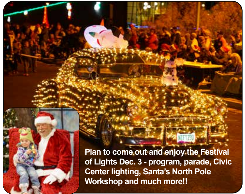
Plan to come out and enjoy the Festival of Lights Dec. 3 - program, parade, Civic Center lighting, Santa's North Pole Workshop and much more!!

fun for all ages. Night Light Parade entries are open until the end of November. Call the PV Chamber for information at 928-772-8857.